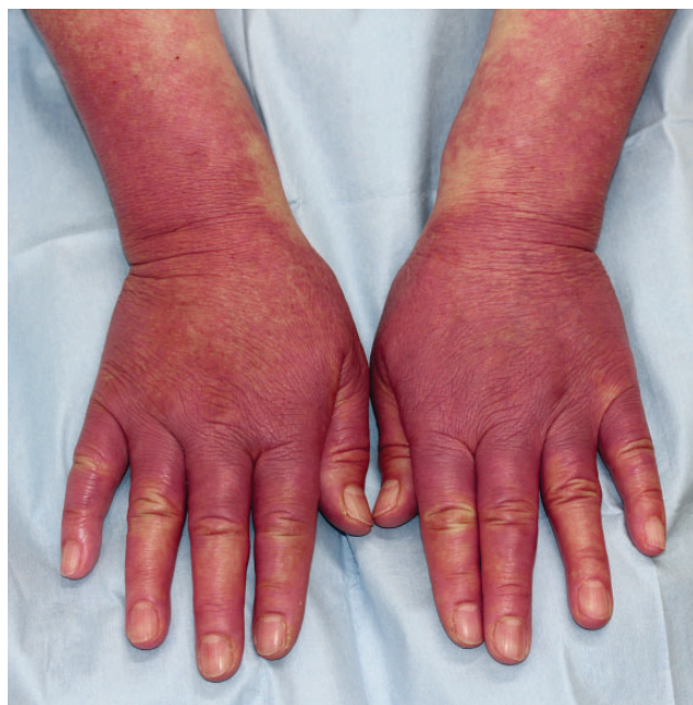
Figure 1. Diffuse purplish erythema on the dorsal surface of the distal forearms, hands, and fingers, with telangiectasia and swollen fingers.

A PREVIOUSLY HEALTHY 70-YEAR-OLD WOMAN presented in winter with a 1-month history of asymptomatic redness of the hands. She denied that the rash had been exacerbated by exposure to the cold temperatures. Physical examination revealed diffuse purplish erythematous plaques symmetrically distributed on the distal forearms and on the dorsal surface of the hands and fingers, with telangiectasia and swollen fingers ( Figure 1 ). She had no other skin lesions.