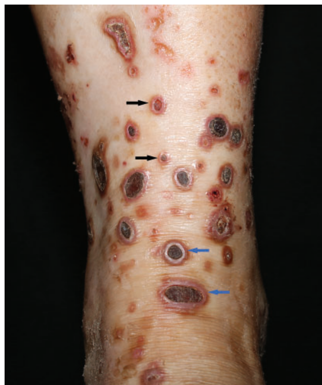
Figure 1. Multiple umbilicated hyperkeratotic papules (black arrows) and nodules (blue arrows) with a central round crusted ulcer on the left ankle.

A 47-YEAR-OLD WOMAN presented with a 2-month history of pruritic eruptions on the left ankle and a complaint of thirst and polyuria for the past year. She was previously healthy and denied a history of insect bites.