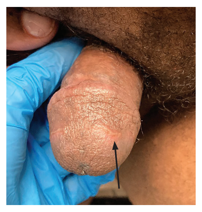
Figure 2. Subtle annular plaque (arrow) with central clearing and raised pink borders on the penis.

a brisk, mixed inflammatory infiltrate including numerous plasma cells within the superficial dermis to the mid-dermis. Staining for Treponema pallidum highlighted numerous spirochetes, consistent with syphilis. Repeat rapid plasma reagin testing was positive with a 1:256 titer.