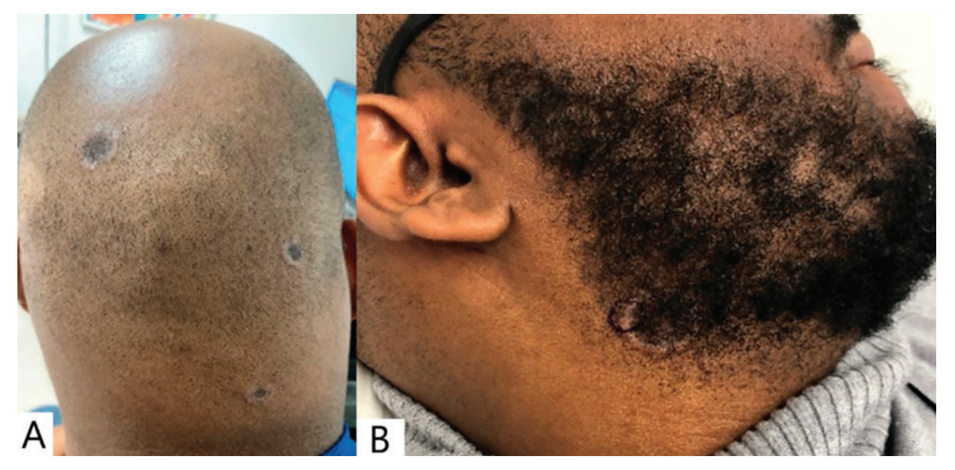
Figure 1. The patient presented with annular lesions on the scalp and angle of the mandible. (A) Annular nonscaly plaques with central hyperpigmentation and a smooth, raised, pink border on the scalp. (B) Annular plaque with central hyperpigmentation, fine scale, and a raised, smooth, pink border on the right mandibular angle.

A1-YEAR-OLD-MALE presented with a 1-month history of pruritic lesions on his scalp, neck, and penis. He had attempted a 2-week course of terbinafine cream, with no improvement. The lesions were unaffected by exposure to sunlight. The patient also reported new-onset wrist stiffness and pain. He had been diagnosed with primary syphilis 9 months prior to presentation, with a reactive plasma reagin titer of 1:64, and had been treated with intramuscular penicillin G benzathine 2.4 million units.