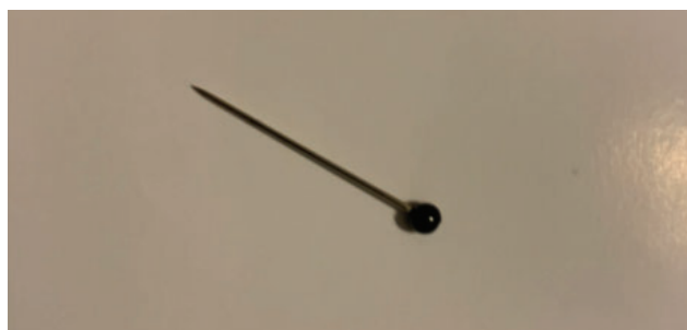
Figure 1. Example of a tailor's pin.

without guarding or rebound tenderness, and exhibited positive bowel sounds.