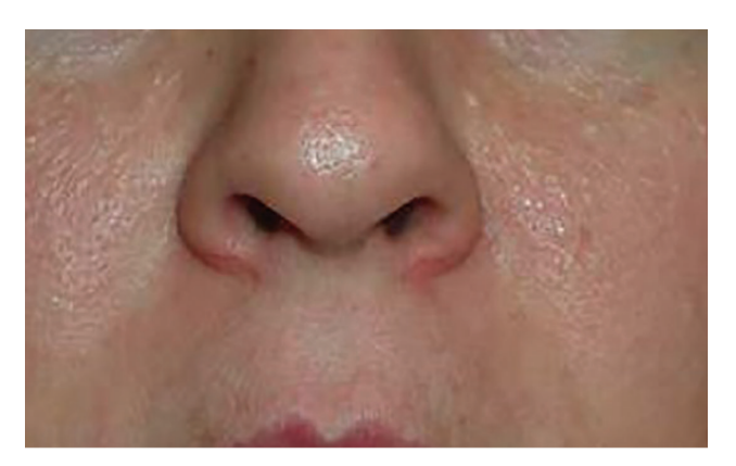
Figure 1. Multiple whitish to skin-colored papules on both cheeks.

43-YEAR-OLD WOMAN PRESENTED to the dermatology department with multiple small skin-colored papules on her cheeks (Figure 1) and acrochordons ("skin tags") on the axillae (Figure 2). She reported that they had appeared over the past few years. Her personal medical history was unremarkable, but she had a first-degree relative with renal carcinoma.