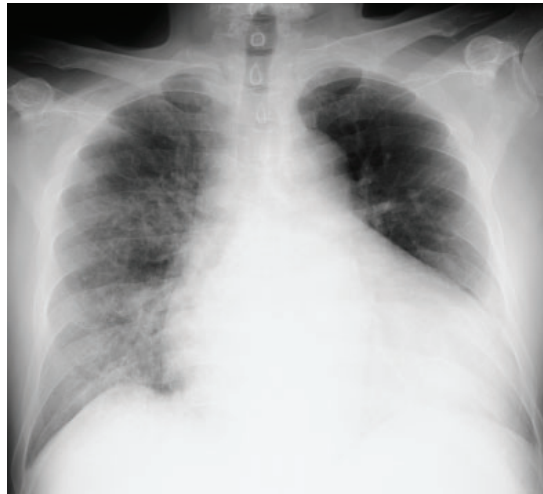
Figure 2. Chest radiograph 72 hours after admission and initiation of intravenous furosemide, nitrates, and noninvasive positive pressure ventilation. Unilateral consolidation in the right lung rapidly improved.

On imaging, cardiogenic pulmonary edema generally appears as an opacity involving the right lung and is frequently attributed to severe mitral regurgitation. 2 The direction of the mitral regurgitation toward the posterior left atrial wall could selectively impede the right pulmonary venous system, 3,4 and the regurgitant flow may focally elevate the pressure in the right pulmonary vein. 4 Our patient had retrograde blood flow toward the posterior left atrial wall. However, we could not confirm “severe” mitral regurgitation. Other factors that would affect the distribution of pulmonary edema include decubitus position of