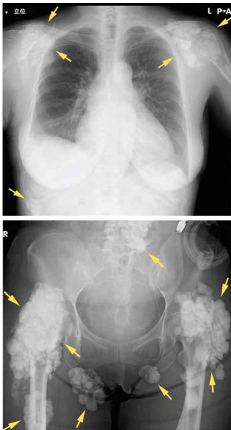
Figure 3. Radiography shows calcified masses (arrows) in a 47-year-old woman with tumoral calcinosis.

The LANDMARK trial 40 (Outcome Study of Lanthanum Carbonate Compared With Calcium Carbonate on Cardiovascular Mortality and Morbidity in Patients With Chronic Kidney Disease on Hemodialysis), published in 2021, looked at patients with end-stage kidney disease in Japan who had risk factors for vascular calcification who were randomized to receive lanthanum or calcium carbonate. It did not find any statistically significant differences