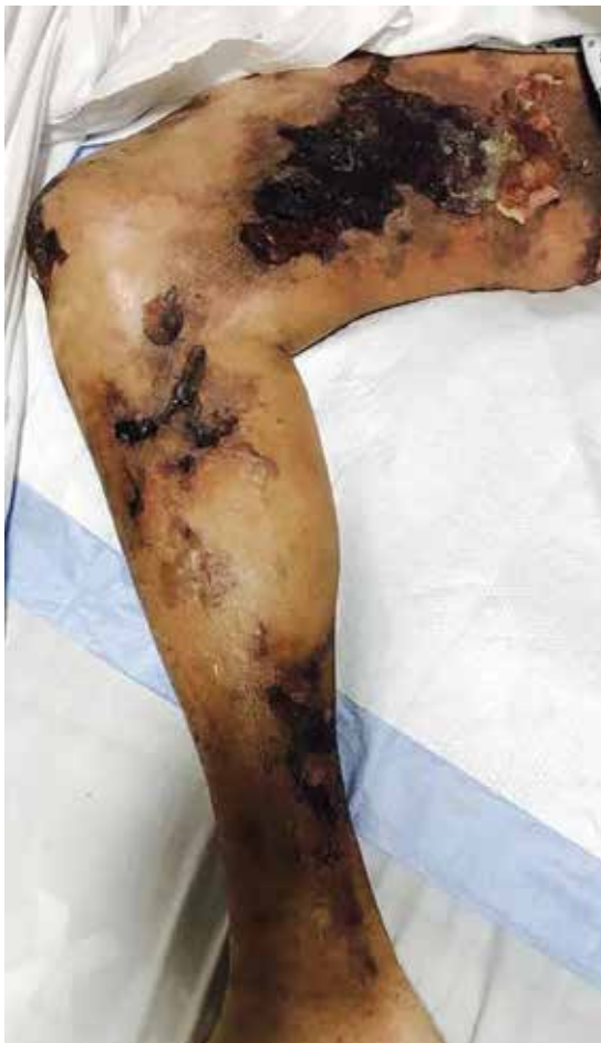
Figure 2. Calciphylaxis in a 51-year-old man with end-stage kidney disease.