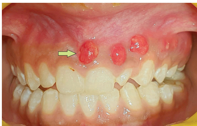
Figure 1. Multiple tracts in the buccal vestibule were noted on the left gum. The arrow indicates the most medial tract.

A 19-YEAR-OLD INDIAN FEMALE WAS referred to the emergency department by her dentist. She had presented to the dentist with 15 days of constant pain in the left premolar tooth, describing the pain 8 out of 10 and radiating to the left cheek. The dentist performed a root canal procedure, which did not resolve the pain, and 1 week after the procedure she developed mobility in her left upper teeth and sinus discharges on the upper buccal mucosa.