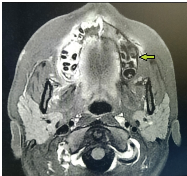
Figure 3. Necrotic left maxillary bone noted on magnetic resonance imaging. The arrow indicates the lateral side of the left maxillary sinus.

inflamed and hypertrophic mucosa of the left maxillary sinus cavity (Figure 2). The left maxillary bone was noted to be necrotic and nonenhancing (Figure 3). The findings on oral examination and imaging raised concern for mucormycosis, and the patient was referred for emergency surgery.