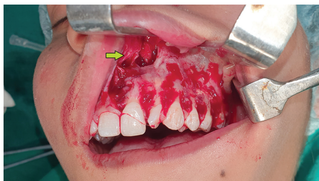
Figure 4. Communication between the buccal vestibule and the maxillary sinuses (arrow) was noted on intraoperative evaluation.

Mucormycosis is an infection caused by filamentous molds that commonly affect immunocompromised patients such as those with cancer or uncontrolled diabetes. 1 In 2021, a systematic review found numerous cases of invasive fungal infection and mucormycosis reported in patients with COVID-19. 2 This has been attributed to diabetes as a common predisposing comorbidity and to treatment with steroids. Our patient was healthy at baseline. We believe that her