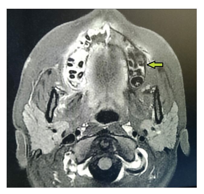
Figure 3. Necrotic left maxillary bone noted on magnetic resonance imaging. The arrow indicates the lateral side of the left maxillary sinus.

inflamed and hypertrophic mucosa of the left maxillary sinus cavity (Figure 2). The left maxillary bone was noted to be necrotic and nonenhancing (Figure 3). The findings on oral examination and imaging raised concern for mucormycosis, and the patient was referred for emergency surgery.