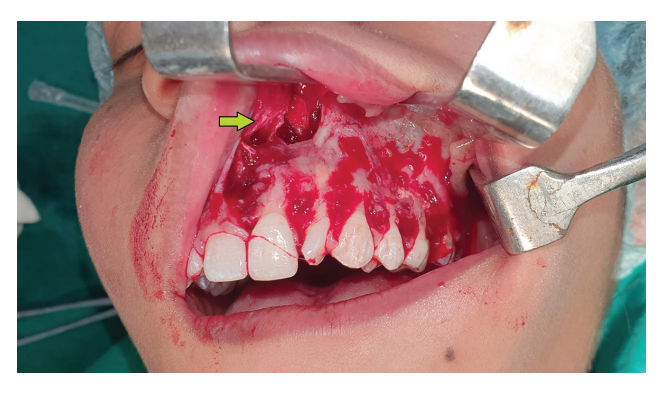
Figure 4. Communication between the buccal vestibule and the maxillary sinuses (arrow) was noted on intraoperative evaluation.

Mucormycosis is an infection caused by filamentous molds that commonly affect immunocompromised patients such as those with cancer or uncontrolled diabetes.<sup>1</sup> In 2021, a systematic review found numerous cases of invasive fungal infection and mucormycosis reported in patients with COVID-19.<sup>2</sup> This has been attributed to diabetes as a common predisposing comorbidity and to treatment with steroids. Our patient was healthy at baseline. We believe that her