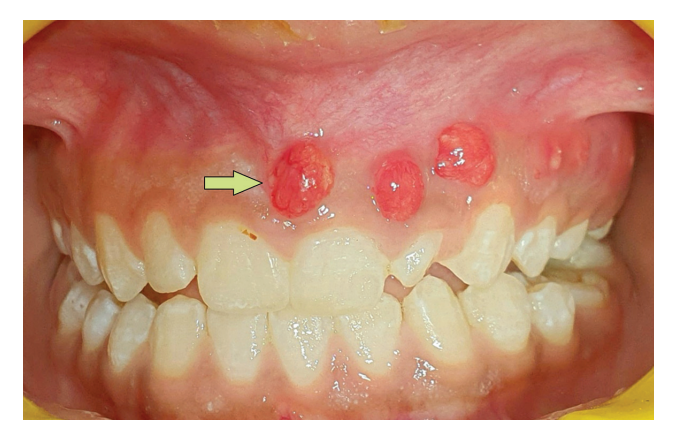
Figure 1. Multiple tracts in the buccal vestibule were noted on the left gum. The arrow indicates the most medial tract.

A 19-YEAR-OLD INDIAN FEMALE WAS referred to the emergency department by her dentist. She had presented to the dentist with 15 days of constant pain in the left premolar tooth, describing the pain 8 out of 10 and radiating to the left cheek. The dentist performed a root canal procedure, which did not resolve the pain, and 1 week after the procedure she developed mobility in her left upper teeth and sinus discharges on the upper buccal mucosa.