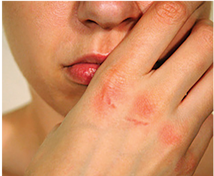
Figure 1. The Russell sign.

Dental erosions are irreversible once they have developed. Use of fluorinated mouth-