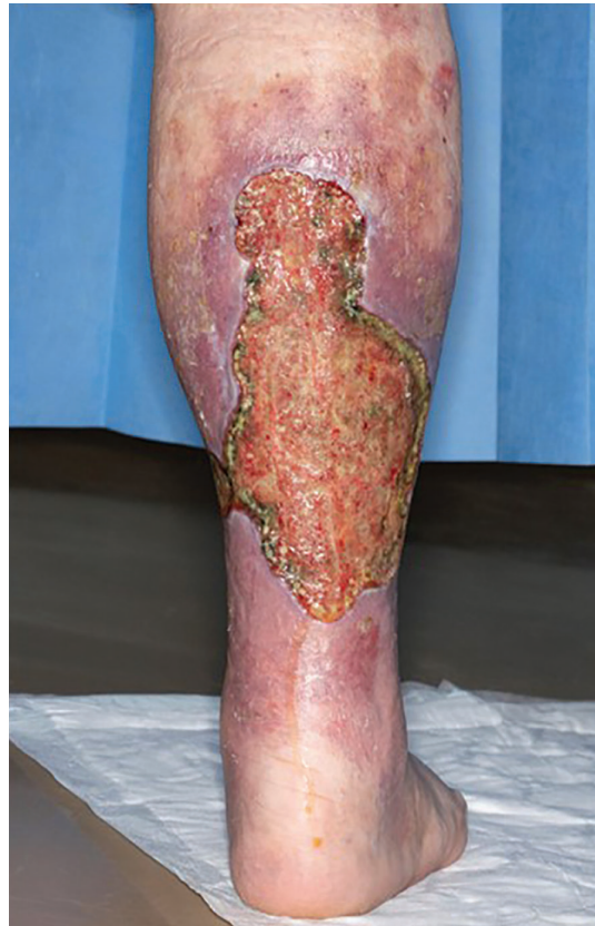
Figure 2. Severe venous ulceration associated with chronic venous insufficiency. Venous ulceration typically occurs in the ankle (gaiter) with surrounding skin changes such as venous eczema (purplish discoloration around the ulcer) and lipodermatosclerosis as well as edema. No clinical feature of the ulcer indicates that chronic venous outflow obstruction (CVOO) is the cause, but the severity of the disease is often worse with CVOO than with superficial venous incompetence, although not exclusive.

The definition of CVD is wide-ranging and patient-specific, often characterized by manifestations of chronic venous hypertension. Symptoms and signs include varicose veins, telangiectasias, pain and discomfort, cramps, restless legs, itching, heaviness, and edema. Skin changes can include venous eczema,