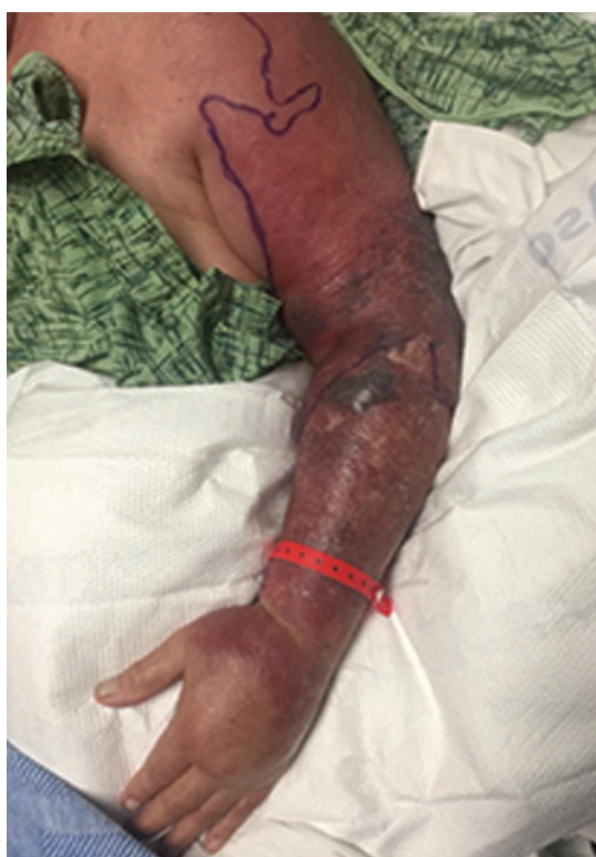
Figure 1. Erythema and swelling of the left upper extremity at presentation.

The patient had no history of allergies to medications or of adverse reactions to vaccinations previously