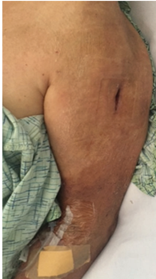
Figure 3. Improvement of the swelling and erythema on hospital day 7.

The mRNA COVID-19 vaccine is a lipid nanoparticle-encapsulated, nucleoside-modified mRNA vaccine that encodes the prefusion spike glycoprotein of the SARS-CoV-2 virus responsible for COVID-19. 1 Local reactions include mild to moderate pain at the injection site, and systemic side effects like fatigue, headache, and fever have been common after the second dose. 2 Immediate reactions