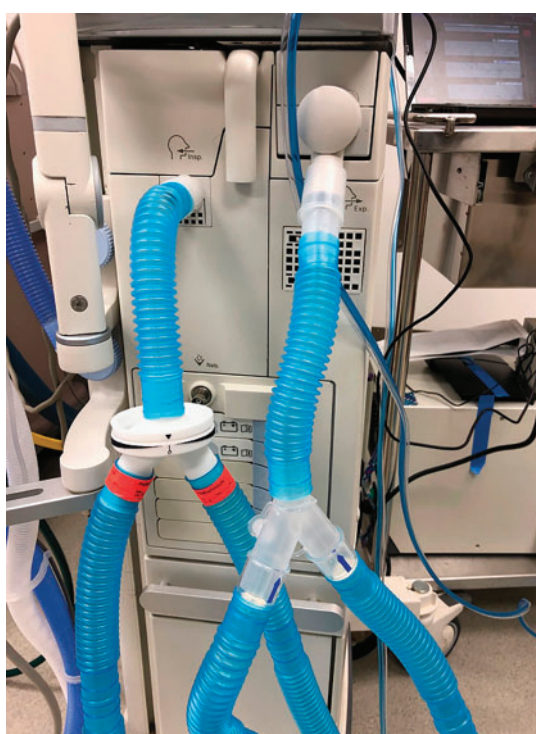
Figure 1. Inspiratory and expiratory inputs to ventilator, with Y connectors.