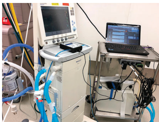
Figure 2. Ventilator setup with volume monitor.

With more patients than machines, multiplex ventilation is a reasonable last resort to prevent certain death