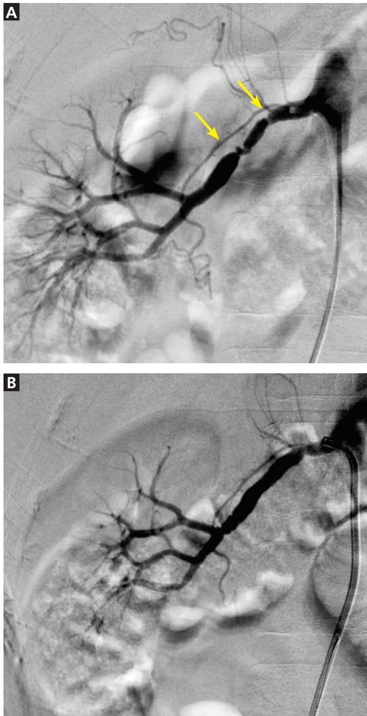
Figure 2. The right renal artery (arrows) before (A) and after (B) percutaneous transluminal angioplasty.

At follow-up 2 years later, his blood pressure was normal without medication; peak systolic velocity of the right renal artery was 203 cm/second.