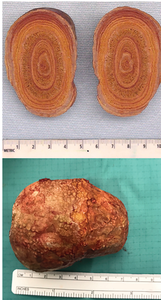
Figure 2. The bladder stone measured 6.9 cm × 4.8 cm × 4.5 cm.

Bladder calculi account for only 5% of all urinary stones; they often arise in the setting of bladder outlet obstruction and are rarely associated with upper tract calculi. 1,4 The earliest giant bladder stone was found in the skeleton of a 7,000 year-old Egyptian mummy, and the prevalence of these stones has dramatically decreased in the developed world due to modernization of diets. 1 No specific nutritional deficiency has been causally linked to bladder stone formation, though these calculi remain most common in North Africa, the Middle East, and India in chronically undernourished children with diets