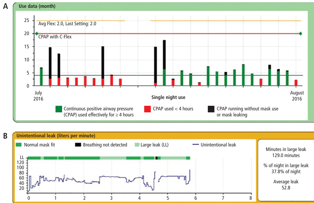
Figure 2. Download of positive airway pressure use data for a month (A) and leak data for a night (B).

study showed that patients with significant Cheyne-Stokes respirations and central sleep apnea had an improved ejection fraction at 3 months and an 81% reduced mortality-cardiac transplant rate. 9