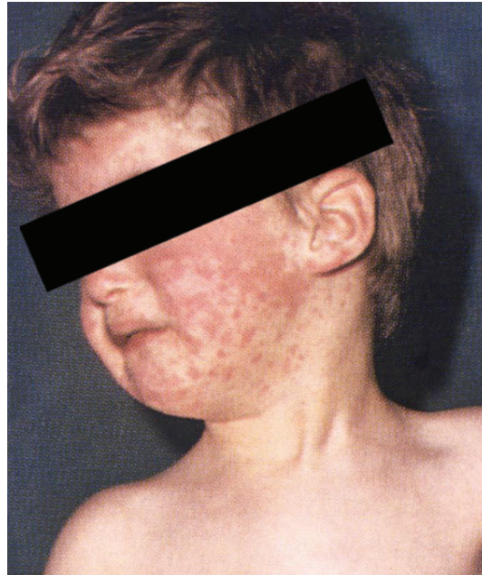
Figure 3. Morbilliform rash of measles.

Frequent complications of measles infection include those related to the primary viral infection of respiratory tract mucosal surfaces, as well as bacterial superinfections. Complications are most likely in children under age 5, nonimmune adults, pregnant women, and