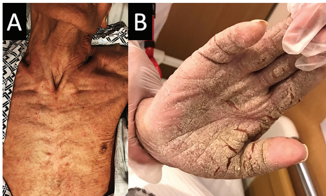
Figure 1. The hyperkeratotic lesions covered the trunk (A), arms, and hands (B).

Norwegian scabies is extremely contagious, and outbreaks can spread in institutions