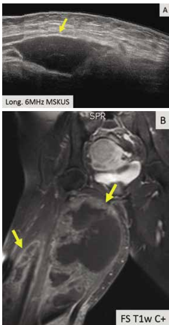
Figure 4. Musculoskeletal ultrasonography is inappropriate for evaluating large areas. Here, ultrasonography did not fully demonstrate the extent or nature of the abnormality within the adductor musculature of the patient's thigh ( A , arrow). MRI demonstrated multiple large enhancing metastatic intramuscular masses ( B , arrows).

the probe images only a thin section of tissue (about the thickness of a credit card), referencing adjacent structures for orientation is more difficult with ultrasonography than with CT or MRI.