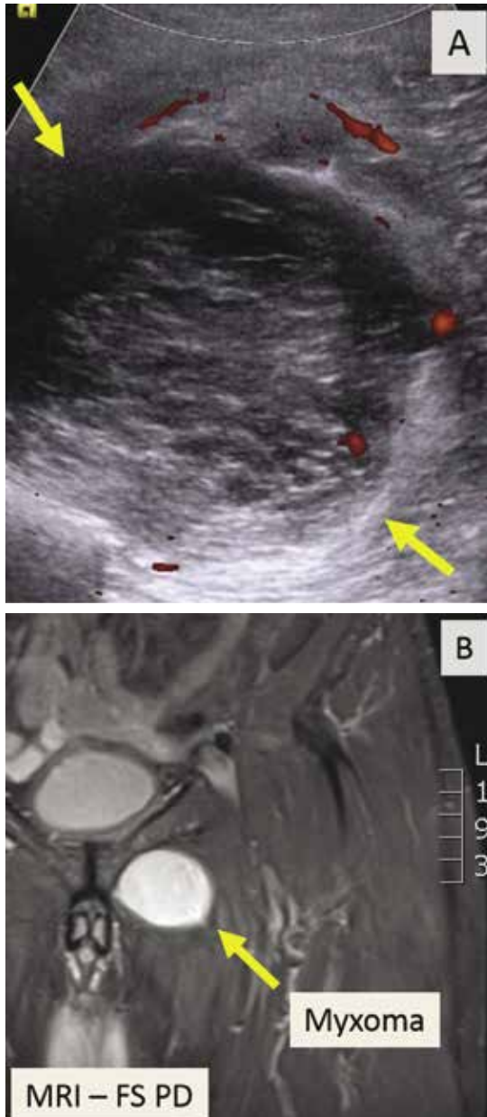
Figure 5. A deep, complex intramuscular soft-tissue mass seen on ultrasonography (A, arrows) required further evaluation with MRI (B, arrow), which better demonstrated the mass's margins and its relationship to surrounding structures.