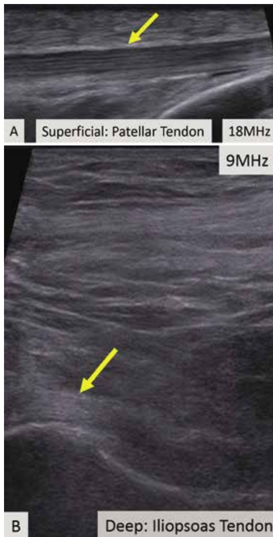
Figure 1. In ultrasonography, a trade-off exists between image resolution and penetration depth. The superficial patellar tendon ( A , arrow) can be seen with high resolution, demonstrating its fine internal structure. The much deeper iliopsoas tendon cannot be seen with the same high resolution because of its deep location ( B , arrow).

available in large hospitals, its use is increasing rapidly, and it will likely become more widely available.