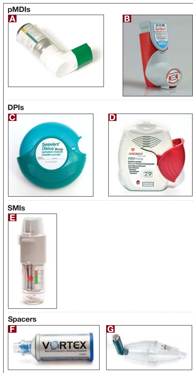
FIGURE 1 Examples of different inhaler device and spacer types

Abbreviations: COPD, chronic obstructive pulmonary disease; DPIs, dry powder inhalers; ICS, inhaled corticosteroid; LABA, long-acting \beta_2 -agonist; LAMA, long-acting muscarinic receptor antagonist; pMDIs, pressurized metered-dose inhalers; SAMA, short-acting muscarinic receptor antagonist; SMI, soft mist inhalers.