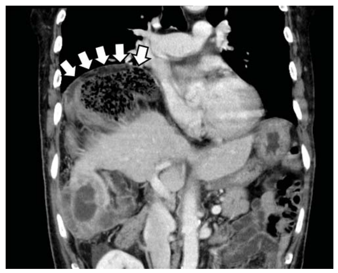
Figure 2. The Chilaiditi sign on computed tomography, with volvulus of the cecum between the diaphragm and liver and a closed-loop obstruction (arrows).

In the article "Gas under the right diaphragm" (Matsuura H, Hata H. Cleve Clin J Med 2018; 85[2]:98-100), Figure 2 appeared upside down. It should have appeared as follows: