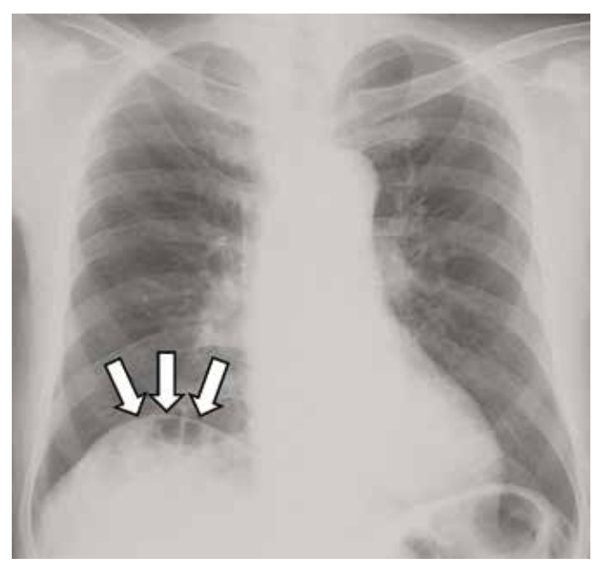
Figure 1. Radiography of the chest with the patient standing showed gas under the right diaphragm (arrows).