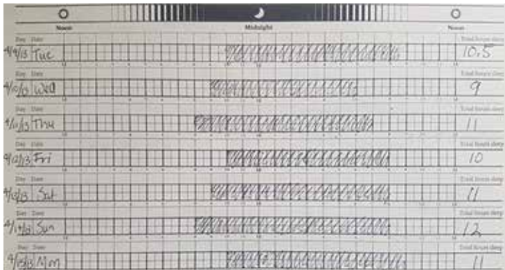
Figure 2. Sleep log from the patient in Figure 1 shows relatively good concordance between perceived sleep schedule and actual sleep schedule.