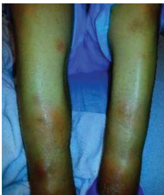
Figure 1. The patient had multiple raised erythematous nodules on the lower extremities consistent with panniculitis.

The syndrome mimics rheumatologic disease, often presenting without abdominal pain