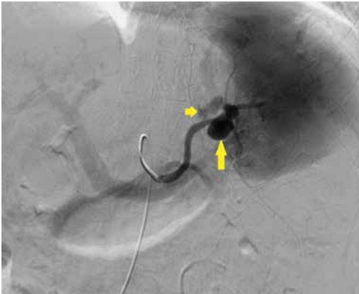
FIGURE 2. Angiography before treatment demonstrates splenic aneurysm (large arrow) with extravasation (small arrow).

Although splenic artery aneurysm rupture is rare, it has a high mortality rate and warrants a high index of suspicion