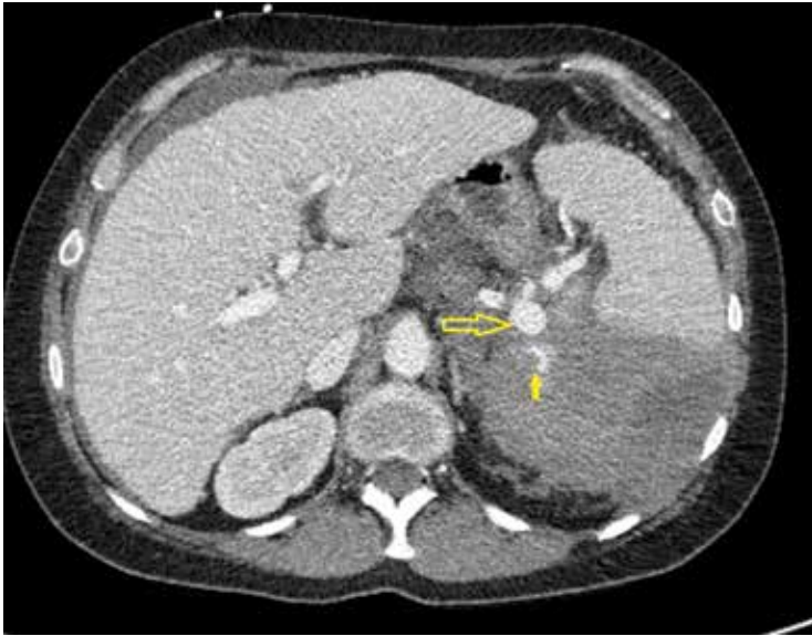
FIGURE 1. Computed tomography of the abdomen demonstrates splenic aneurysm (large arrow) with active extravasation of contrast (small arrow).

10%–20% of hospitalized patients with cirrhosis and ascites develop spontaneous bacterial peritonitis