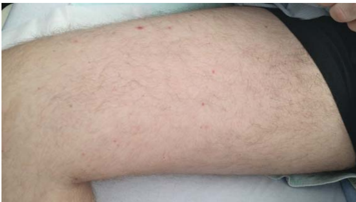
FIGURE 1. At presentation, the patient had a sparse, erythematous, macular, nonblanching rash on the lower and upper limbs.

The patient had been taking a TNF-alpha inhibitor and had recently returned from Mexico