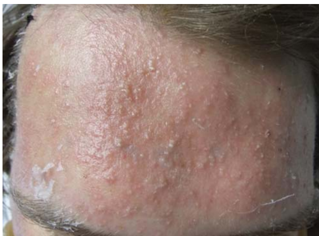
FIGURE 1. A brightly erythematous plaque on the forehead with monomorphic pustules was noted on day 3 of piperacillin-tazobactam infusion.

The appearance of sterile pustules after starting a new antibiotic raised suspicion for acute localized exanthematous pustulosis, a variant