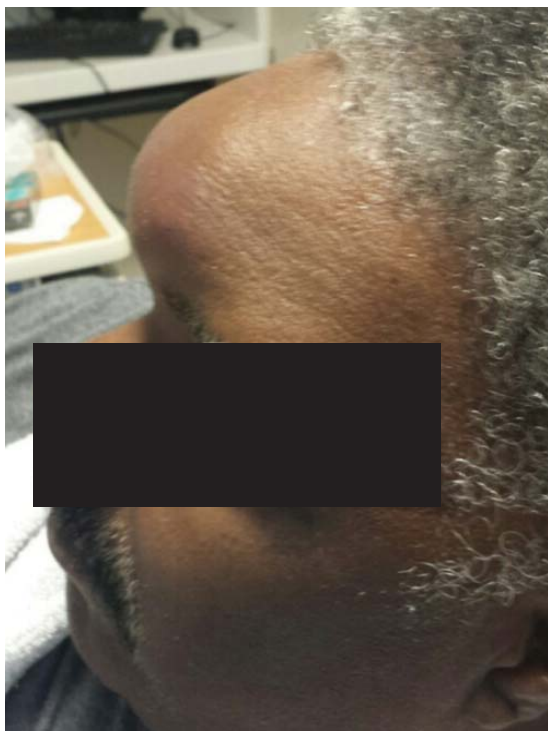
FIGURE 1. At presentation, the swelling measured 3 by 4 cm. It was warm, erythematous, fluctuant, and tender to palpation.

A 60-YEAR-OLD MAN presented to our emergency department with a 4-day history of frontal headaches he described as “stinging.” He had also had a large swollen area on his forehead for the past 8 weeks.