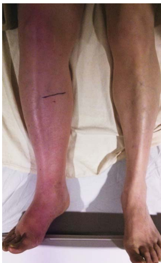
FIGURE 1. The patient had painful swelling and bluish-red discoloration of the right leg at the time of presentation.

In the immediate postprocedural period, there was marked reduction in swelling and normalization of skin color (Figure 3). The patient did not experience significant bleeding during or after the procedure. Treatment with intravenous unfractionated heparin was continued during the hospital stay, and he was discharged on warfarin with a therapeutic international normalized ratio. At a follow-up visit 3 months later, he was asymptomatic.