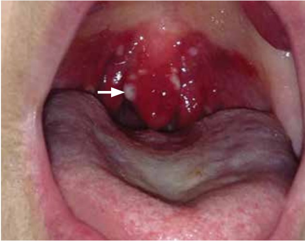
FIGURE 1. The uvula was swollen and red, with exudate (arrow).