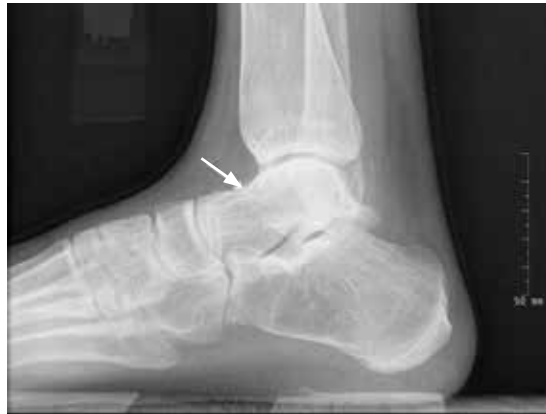
FIGURE 1. A radiograph of the right ankle at the time of presentation shows evidence of talar dome collapse (arrow) due to avascular necrosis of the talus body.

Radiography of the ankle (Figure 1) shows a subtle lucency in the talar dome with minimal subarticular collapse seen on the lateral view, suggestive of avascular necrosis and diffuse osteopenia. Joint spaces are maintained.