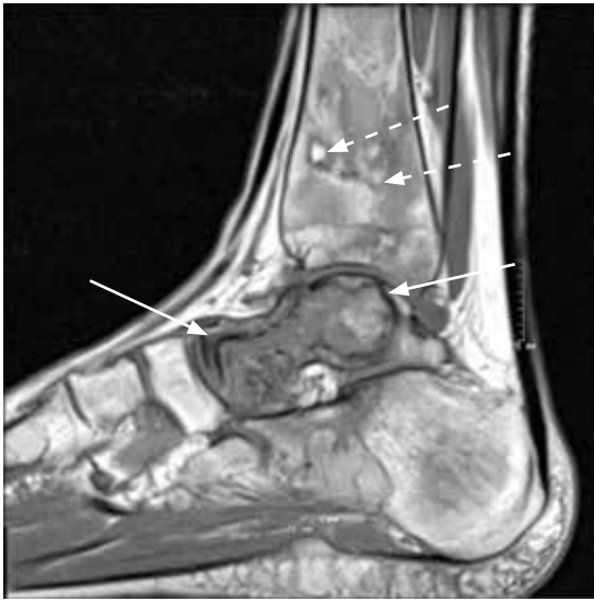
FIGURE 3. On sagittal T1-weighted magnetic resonance imaging, the serpentine black line indicates avascular necrosis in the talar head, neck, and body (solid arrows). Found incidentally were smaller foci of avascular necrosis in the distal tibial metaphysis and epiphysis (dashed arrows).