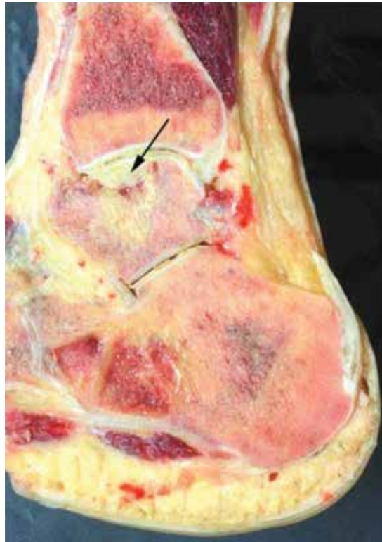
FIGURE 4. A sagittal section after amputation shows the collapsed dome of the talus and bone necrosis (arrow.)

These drugs are extremely expensive. Currently, the estimated cost of therapy for 1 year would be $432,978 for imiglucerase, $324,870 for taliglucerase alfa, and $368,550 for velaglucerase alfa. (The estimated costs are for 1 year of treatment for a 70-kg patient at 60 U/kg every 2 weeks.) 18 Taliglucerase alfa is less