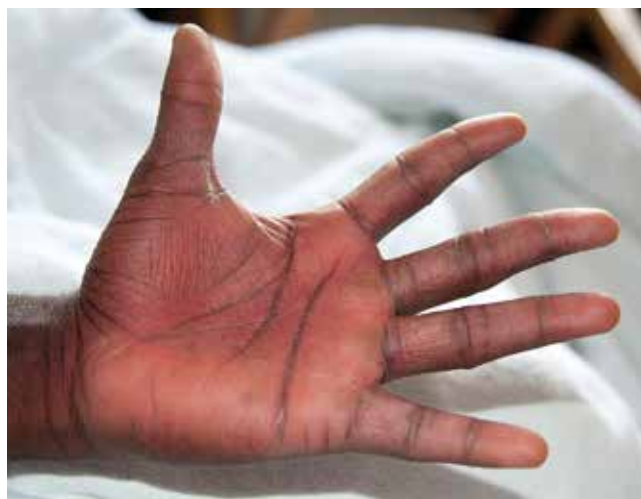
FIGURE 2. The patient had confluent erythema with petechiae on the palms.

standard vaccines including a tetanus booster were up to date.