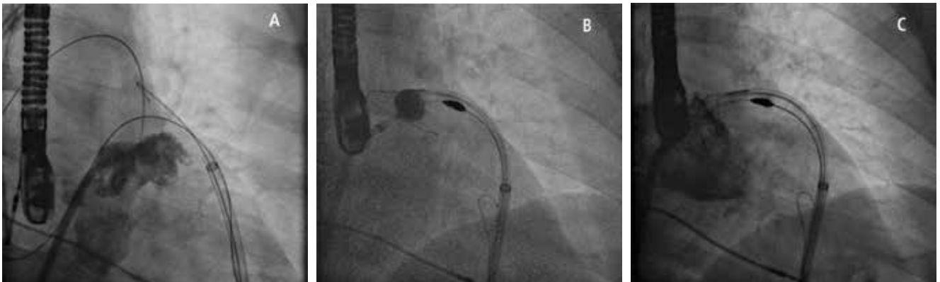
FIGURE 2. Placing the Lariat closure device. Panel A shows contrast injected through the transseptal sheath filling the left atrial appendage. Panel B shows the Lariat positioned over the neck of the left atrial appendage, which is denoted by the inflated balloon. Panel C shows repeat contrast injection after closing the Lariat “lasso” and demonstrates isolation of the appendage after lasso closure. To complete the procedure, the balloon catheter and the endocardial magnet-tipped wire are withdrawn from the appendage, the suture is deployed, and complete ligation is reconfirmed with transesophageal echocardiography and another contrast injection.

Incomplete closure or clipping actually increases the risk of thrombosis and embolization