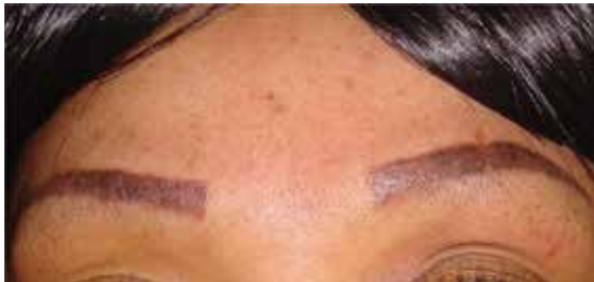
FIGURE 4. After treatment.

an elevated serum angiotensin-converting enzyme level, but this finding alone is not sensi-