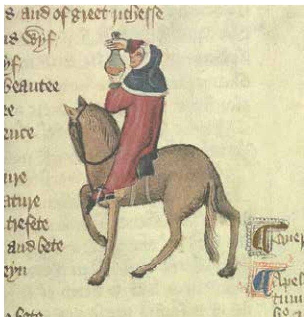
FIGURE 1. Urinalysis on horseback. From the Physician’s Tale in the Ellesmere manuscript of Geoffrey Chaucer’s Canterbury Tales , c. 1400.

Gilles de Corbeil in the 12th century wrote a poem on judging urine, intending it as an aid for remembering the supposed 20 different diagnostic colors of urine and describing in detail the use of the urine flask, a bladder-shaped container for studying the