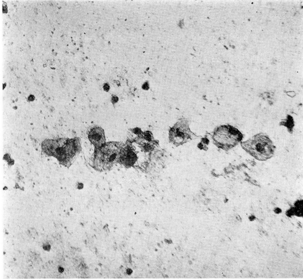
FIGURE 1: Vaginal smear from surgical castrate, untreated. (X225)

jective benefit within three days after beginning stilbestrol therapy and obtain a maximum effect from a given dose within ten to fourteen days.