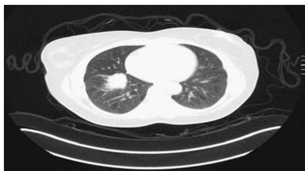
FIGURE 1. Fused 18 F-fluorodeoxyglucose-positron emission tomography is used for staging patients with non-small cell lung cancer. This image shows an N2-node.

Stress testing, whether by nuclear imaging or dobutamine echocardiogram, is also indicated, especially if considering pneumonectomy. A quantitative ventilation-perfusion scan is indicated for a more definitive evaluation of pulmonary function.