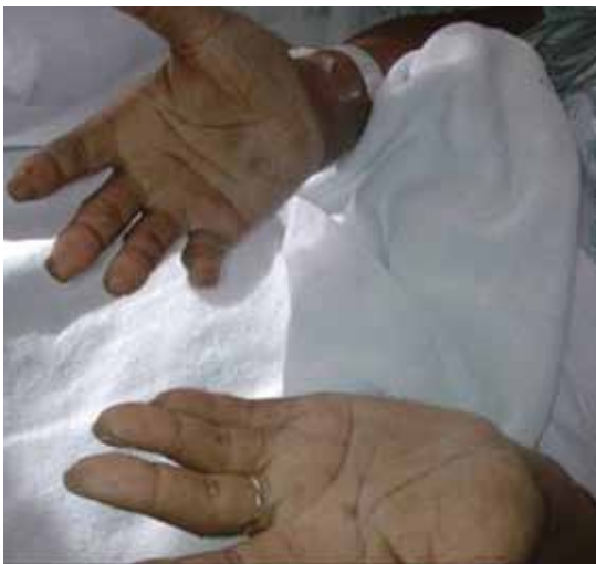
FIGURE 1. The patient has hyperpigmentation of the skin creases on the palms, as well as on the lips and the lower gum.

A 65-YEAR-OLD MAN PRESENTS with a 2-month history of generalized weakness, dizziness, and blurred vision. His symptoms began gradually and have been progressing over the last few weeks, so that they now affect his ability to perform normal daily activities.