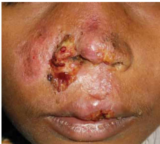
FIGURE 1. Ulcerated plaque with destruction of the right nasal wing.