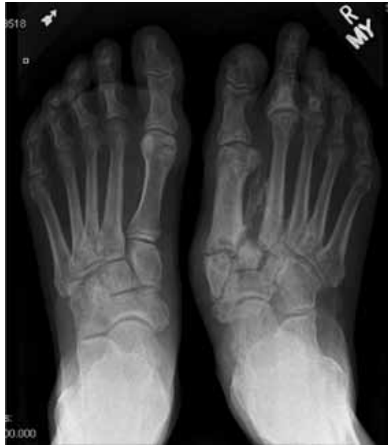
FIGURE 6. Stage 3. This plain radiograph shows the reconstruction stage with resolved edema, absence of osteosclerosis, and relative osteopenia. Also seen is healing of the fractures of the second and third proximal phalanges, the site of the ecchymosis on plain films in FIGURE 2 .

Radiography. Radiographic findings are important in diagnosing Charcot neuroarthropathy, although they are less helpful in patients with stage 0 disease, such as our patient, in whom the condition has not yet progressed to fracture or dislocation. All foot