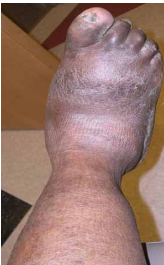
FIGURE 1. The patient's right foot at presentation.

He is 53 years old, with poorly controlled diabetes and peripheral neuropathy