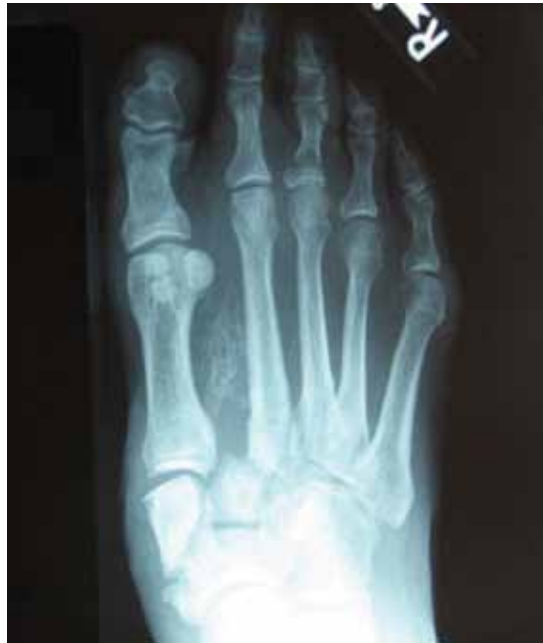
FIGURE 3. In this radiograph taken 3 to 4 months after the initial presentation, Charcot neuroarthropathy has progressed to stage 2 after delayed immobilization.

A radiograph in our patient ( FIGURE 2 ) taken during his initial emergency department visit