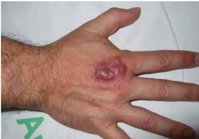
FIGURE 1. A red nodule with central ulceration on the right hand.