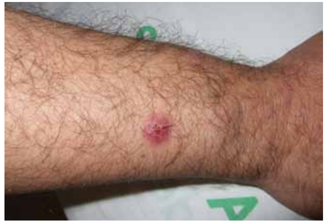
FIGURE 2. A nodule on the patient's forearm with a sporotrichoid distribution. Locoregional lymph nodes were not palpable.

A 46-YEAR-OLD HEALTHY MAN presents with a 15-day history of a tender subcutaneous nodule on the dorsum of the right hand that appeared after cleaning his aquarium. He has no fever or systemic symptoms. For 2 weeks he has been taking amoxicillin-clavulanate (Augmentin) and metronidazole (Flagyl), but without an adequate response.