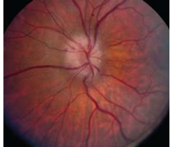
FIGURE 2. In papillitis, mild swelling and elevation of the optic disc can be seen. The small splinter hemorrhage seen at 10 o'clock is not typical of optic neuritis associated with multiple sclerosis.

Optic neuritis is important to recognize so that therapy can be started early