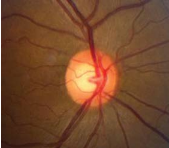
FIGURE 1. In retrobulbar optic neuritis, the inflammation and demyelination occur behind the globe of the eye. The optic disc appears normal with no signs of swelling or pallor.