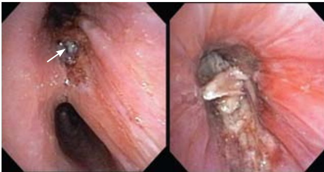
FIGURE 2. Left: bronchoscopic image at the level of the division of the right upper lobe and bronchus intermedius. A grey-white endobronchial lesion is seen in the right upper lobe. Right: Close-up of the fungating endobronchial lesion in the right upper lobe.