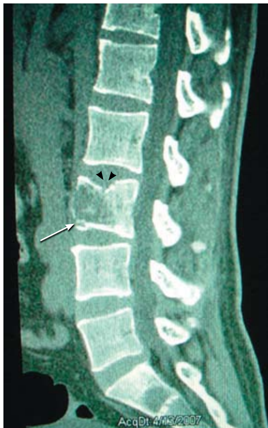
FIGURE 1. A 43-year-old man with a 2-week history of progressive back pain and an abdominal mass. Sagittal CT scan shows an osteolytic lesion of the L3 vertebral body (arrow). The primary tumor was renal. Fracture of the vertebral end plate (arrowheads) may cause first symptoms of pain.

mal reflexes. Signs or symptoms of spinal cord compression should be investigated immediately.