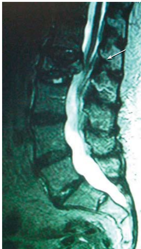
FIGURE 2. A 63-year-old woman with history of hepatocellular carcinoma who presented with bilateral leg weakness and debilitating back pain. T2-weighted MRI shows pathologic compression fracture of the L2 vertebral body with retropulsion of fracture fragments into the canal and severe central canal stenosis (arrow).

The ESR and CRP are almost always elevated with systemic neoplasia