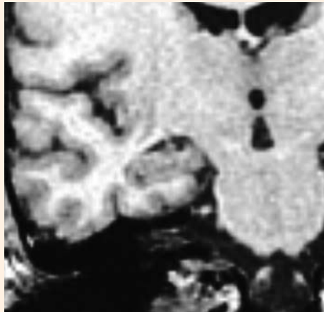
Right hippocampus at baseline