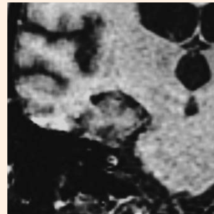
Right hippocampus at 1 year