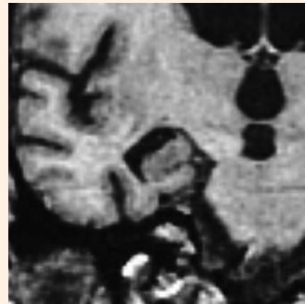
Right hippocampus at baseline