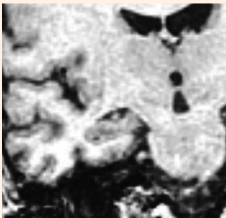
Right hippocampus at 1 year