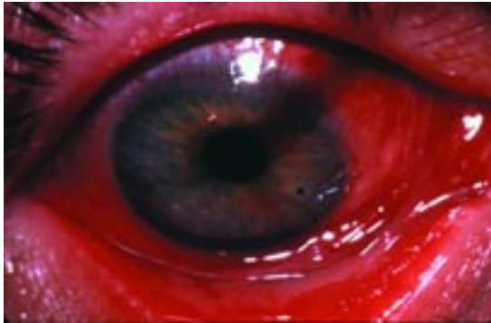
FIGURE 2. Viral conjunctivitis with an intensely red eye and a white fibrin membrane in the inferior fornix.

prone to dryness and irritation. Treatments include artificial tears, lubricating ointments, and surgery—gold weight placement or suturing the eyelid margins (tarsorrhaphy).