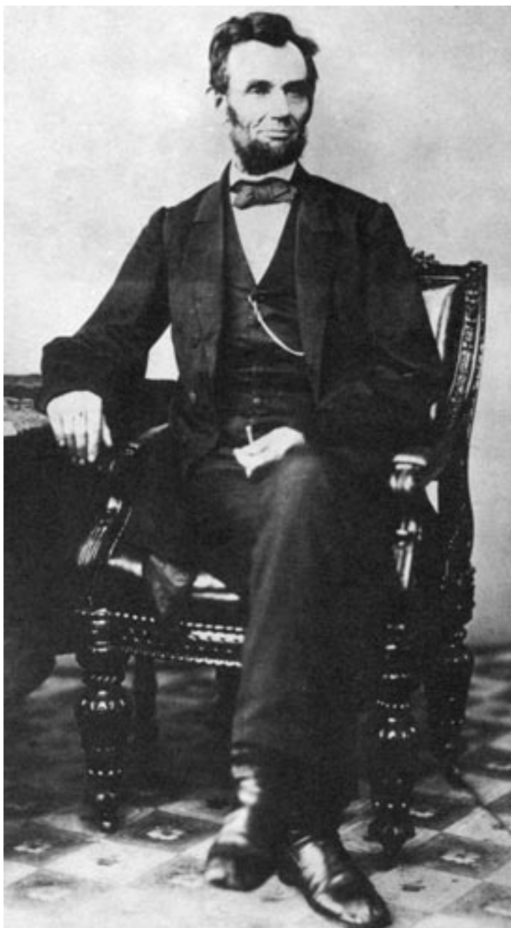
FIGURE 1. Some believe that the blurriness in Lincoln’s left foot in this photograph is due to excessive pulsation in the popliteal artery due to aortic regurgitation secondary to Marfan syndrome—the eponymous Lincoln sign.

NOVEMBER 8, 1863.