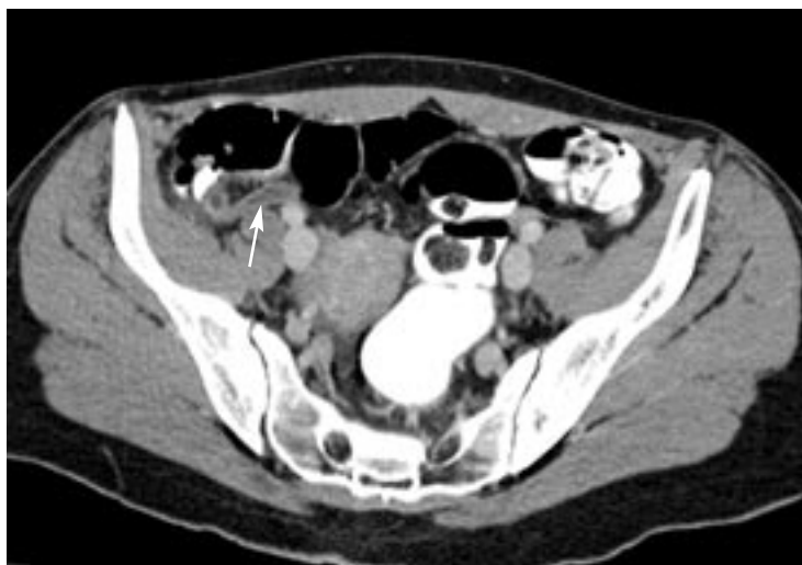
FIGURE 3. Classic image of acute appendicitis (arrow) on CT in our patient.

exceed 6 mm in diameter. The appendix is mobile, having its own mesentery, and its position relative to the cecum can vary.