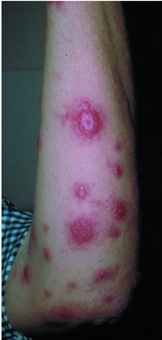
FIGURE 2. Secondary rash of syphilis in a patient with human immunodeficiency virus infection.

Patients with HIV may have unusual presentations of syphilis