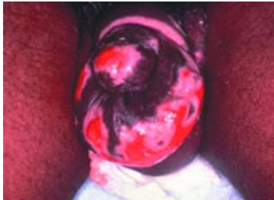
FIGURE 3. Herpes simplex virus lesion in a patient with human immunodeficiency virus infection.

A large variety of alternative medicines for herpes outbreaks are popular and are tout-