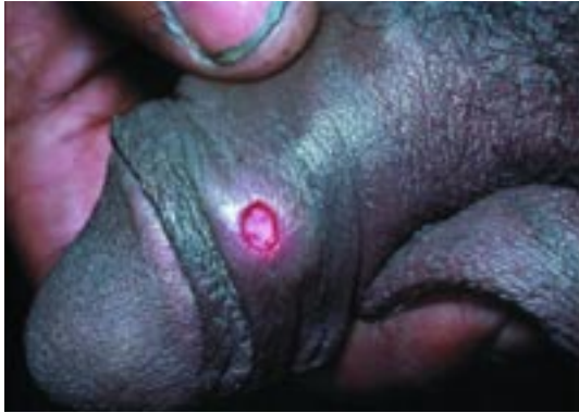
FIGURE 1. A classic syphilis lesion.

STDs in 2005, with 50% of Americans acquiring at least one by age 35. An estimated 20% of children have had sexual intercourse by age 14, and 25% of teenagers acquire an STD before high school graduation, regardless of their socioeconomic status.