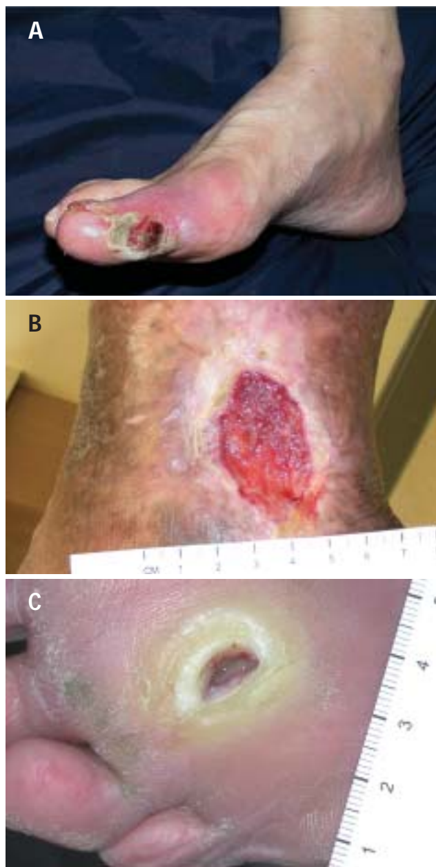
FIGURE 2. An ischemic ulcer in a patient with peripheral arterial disease that has progressed to critical limb ischemia (A), in contrast with a venous stasis ulcer (B) and a neurotrophic ulcer in a patient with diabetes (C).

text of risk factors for atherosclerosis to improve diagnostic accuracy. They noted that a PAD screening score derived from pulse readings using a handheld Doppler probe was particularly helpful for determining which patients should undergo further studies. 16