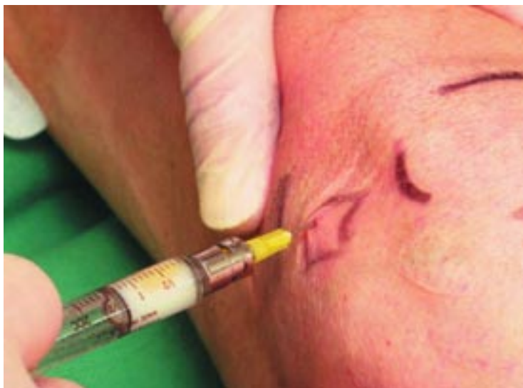
FIGURE 1. Top, arthrocentesis of the knee joint via the usual medial entry. Bottom, actual injection of corticosteroid suspension into knee via medial approach.

All injectable corticosteroids except cortisone and prednisone can promptly and significantly reduce inflammation in an inflamed joint. The more soluble the corticosteroid, the more rapidly it is absorbed and the shorter the duration of effect. Tertiary butyl acetate (TBA, tebutate) is an ester form that prolongs the duration of action of the compound as a result of decreased solubility, which probably causes its dissociation by enzymes to proceed more slowly.